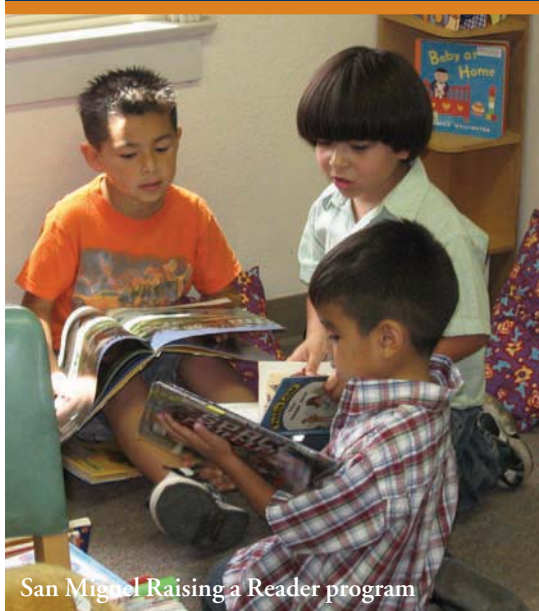
San Miguel Raising a Reader program

Four-year-olds with access to the Raising a Reader program are exceeding national norms for kindergarten readiness when compared with other students from families of low education and income status.