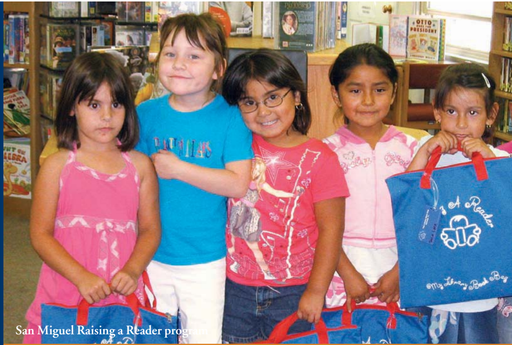
San Miguel Raising a Reader program

Additionally, the San Luis Obispo County program includes one book in Spanish as well as a multi-language video that teaches parents and children how to bridge the literacy gap. At the end of the program, each child receives a blue library book bag to use as they enter kindergarten.